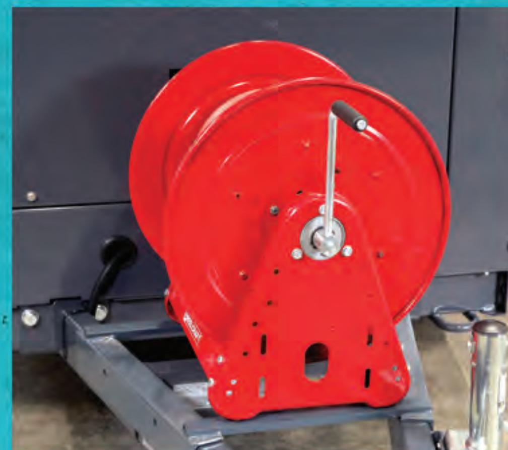
Single Hose Reel Kit