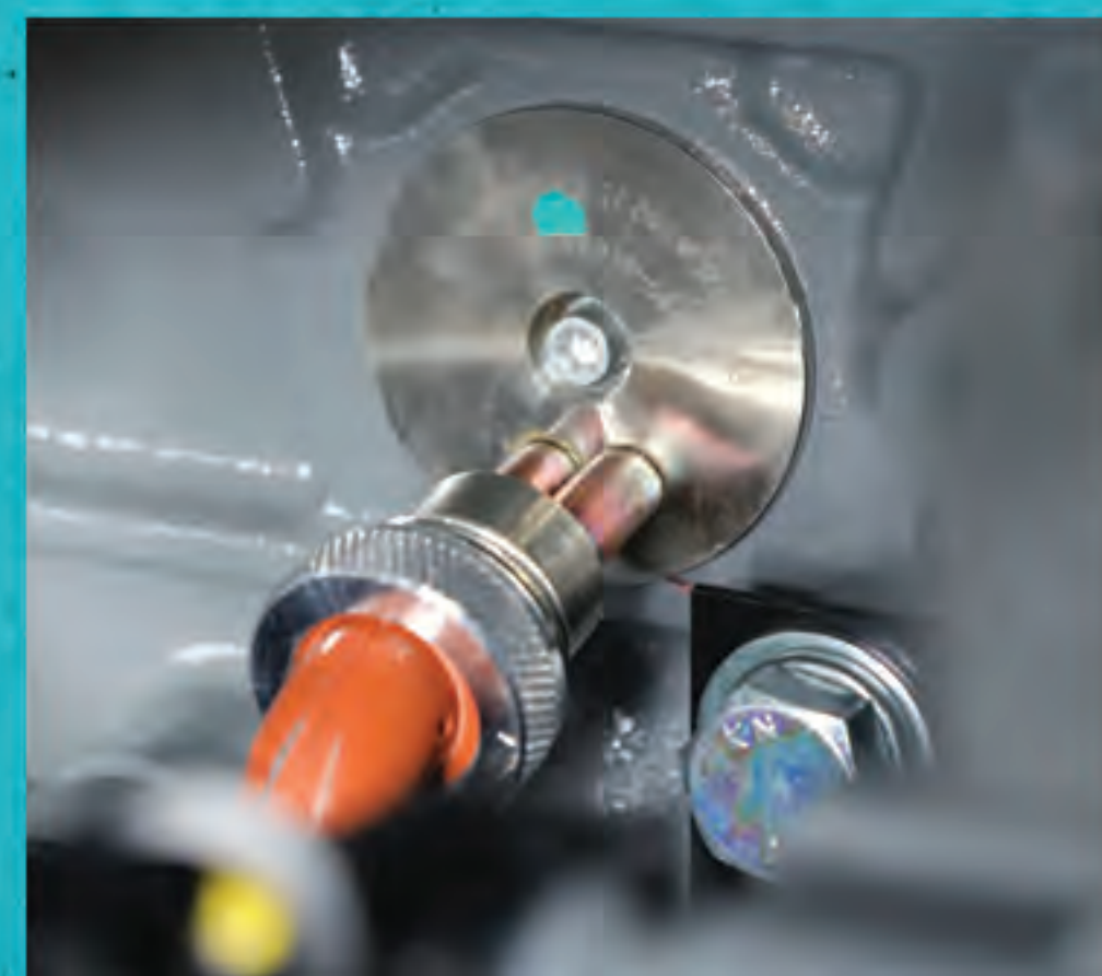
Engine Block Heater