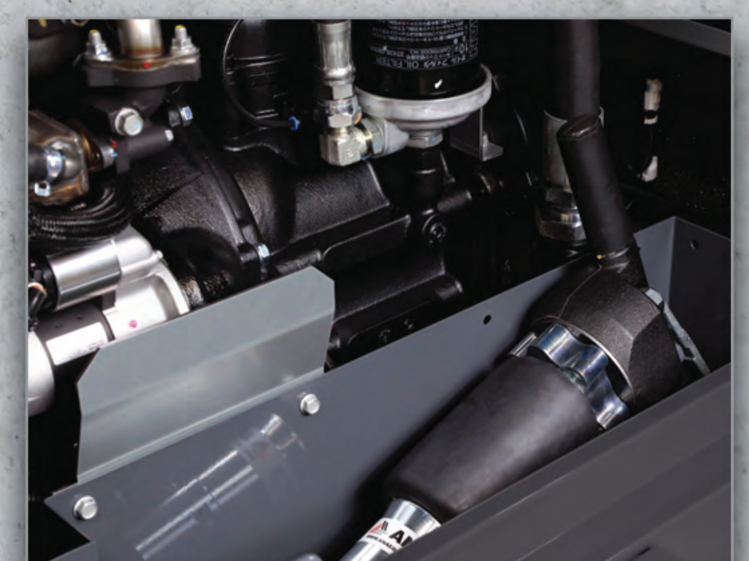
6 | Interior Storage Compartment Holds a 90# breaker or other air tools

BEST-IN-CLASS POWER TRANSFER // FUEL EFFICIENCY // dBA RATING THE INDUSTRY'S HIGHEST-QUALITY MOBILE AIR COMPRESSORS