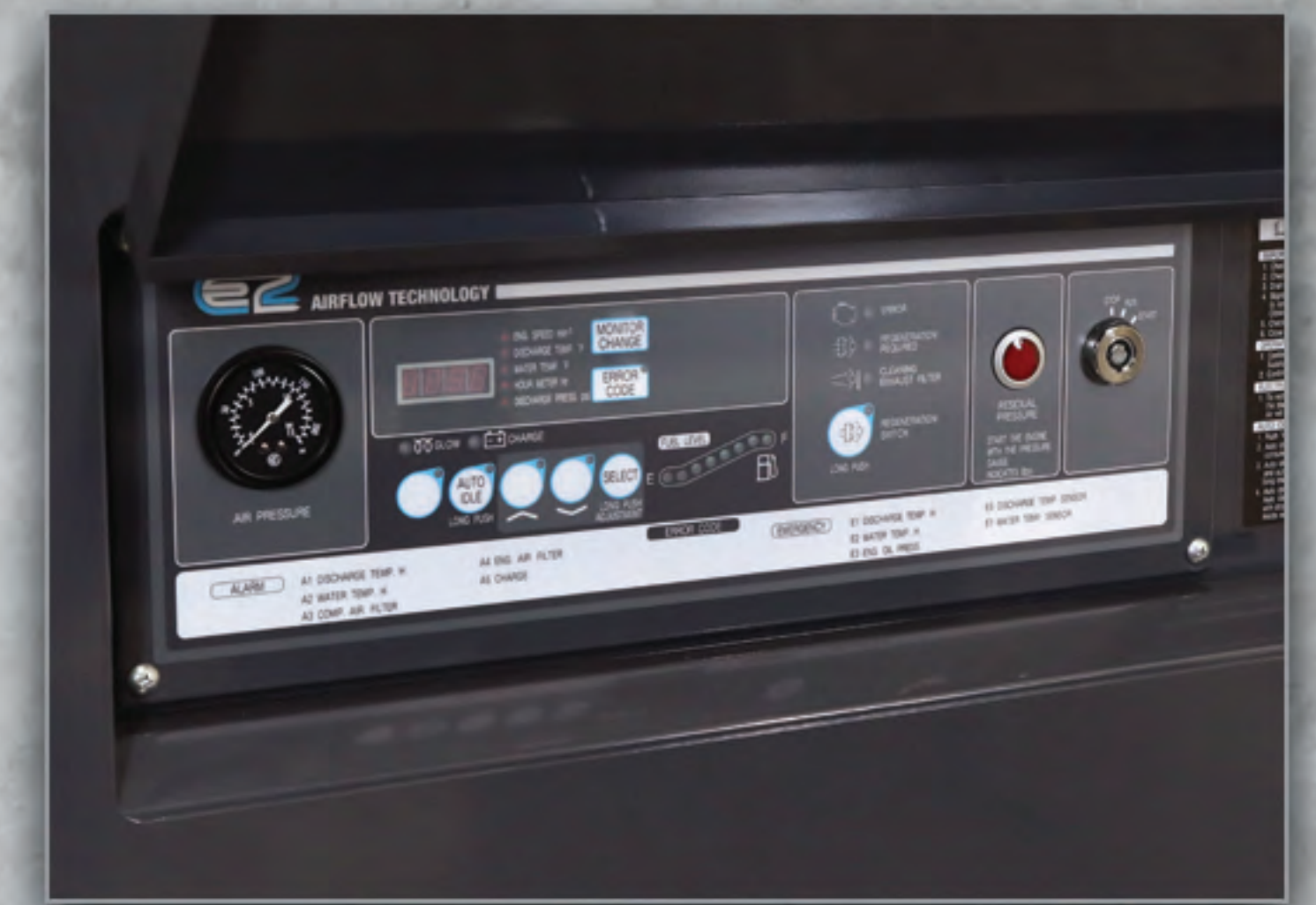
1 | Keyed Start and Digital Monitor with Auto Idle Mode