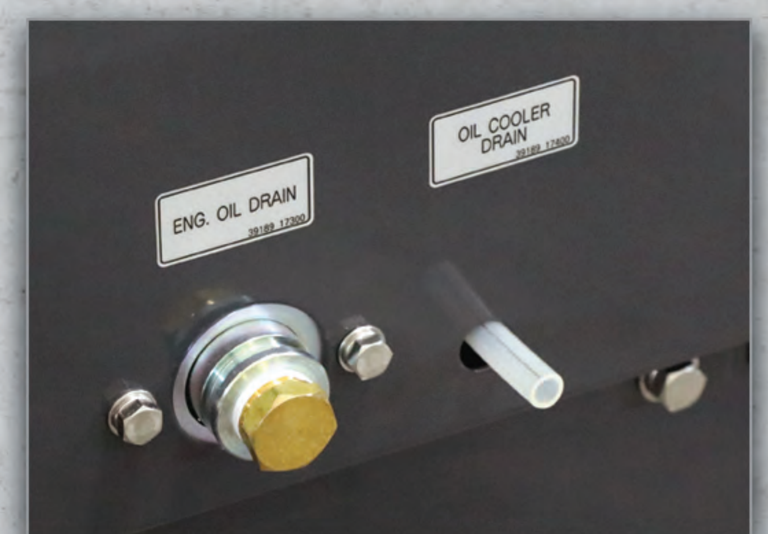
11 | Exterior Service Drains Quick drain valves for Engine Oil and Oil Cooler fluids