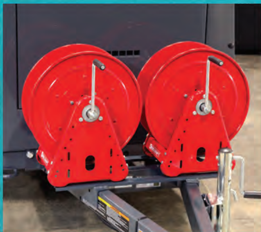
Double Hose Reel Kit