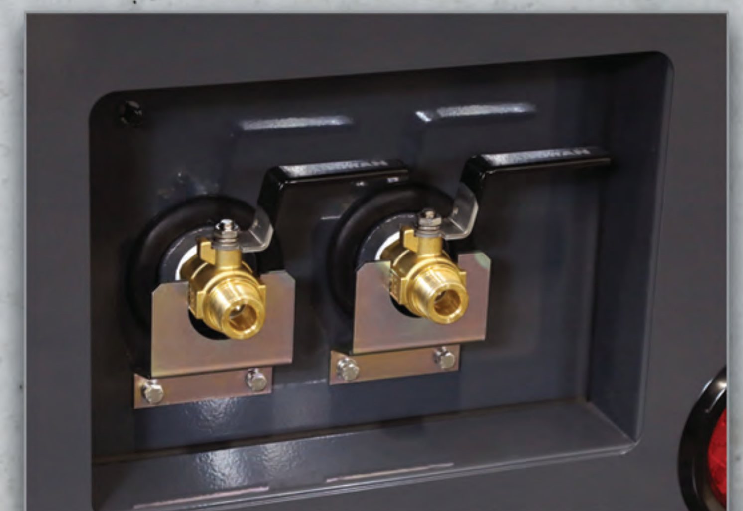
2 | Air Connections 3/4" Male Ball Valve x 2